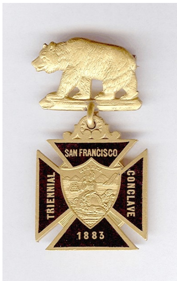
Grand Encampment 1883 Triennial Conclave Medal San Francisco, California

Tuesday, August 21, 1883 the Grand Encampment opened for business meetings and lasted until Friday. The Divine Service was a new feature at the Triennial and was “The greatest feature of the Conclave.” Seventy banners of different Commanderies hung in the Grand Asylum. There was entertainment every evening in the pavilion, with a different program each night. The ladies provided a “Garden of Welcome” for the visitors, and was one of the most pleasing features of the Conclave. There were excursions around the bay by boat, and by rail to the vineyards and wineries of Napa Valley, to Santa Rosa, Santa Cruz, Monterey and other areas. The Grand Master was greeted by the Mayor of San Francisco and other officials. The Grand Lodge laid a cornerstone to the Garfield monument in Golden Gate Park, and the military took part in that too, including veterans and government officials. The Grand Banquet was held at the Palace Hotel and was “everything the heart could wish.” 3000 rooms were taken up by the Sir Knights. The San Francisco police cooperated fully with every wish and the grand parade had no interruptions,