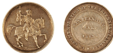
Obverse and reverse of 1883 Commemorative Coin